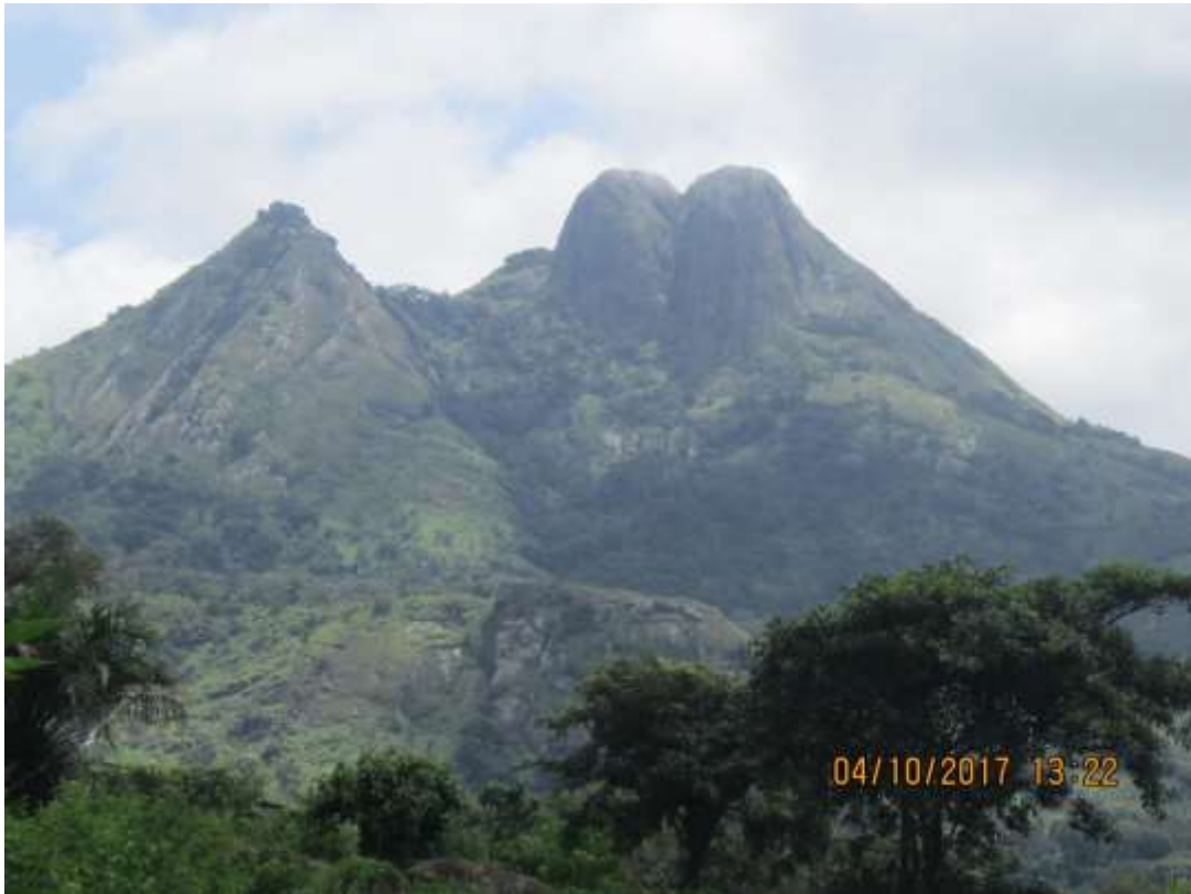
Mt Konossou