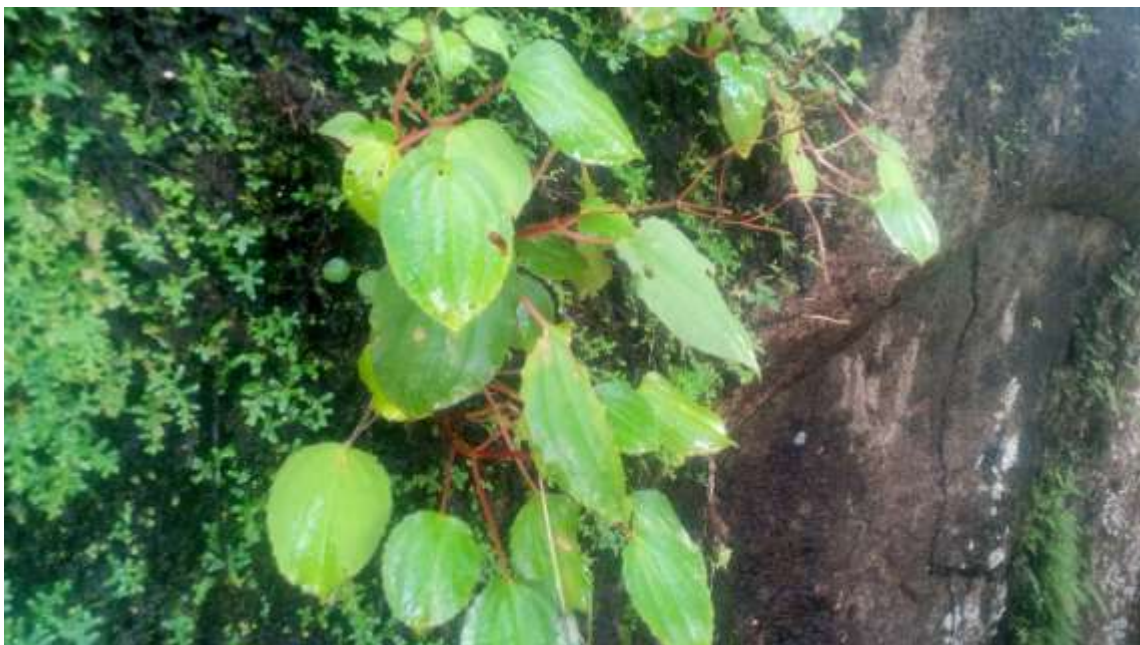
Feliciadamia stenocarpa on humid granite rocks, Mt Konossou