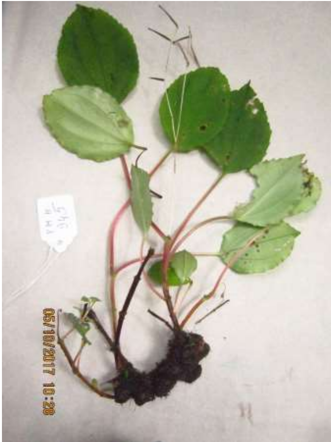
Feliciadamia stenocarpa