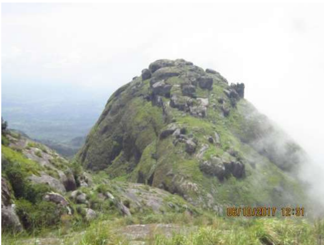
Mt Konossou peak