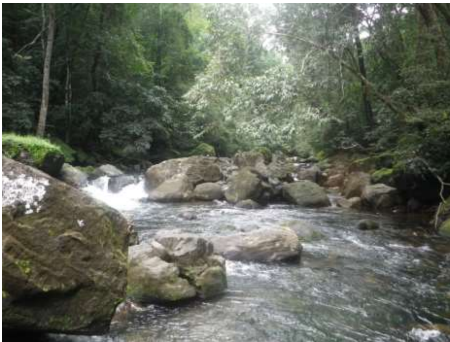
Foret de Gbélén