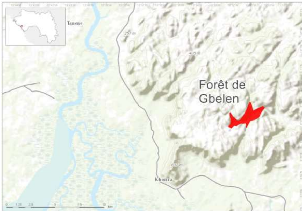
Map showing the proposed area for protection as a TIPA. Core area in red, buffer zone in yellow.