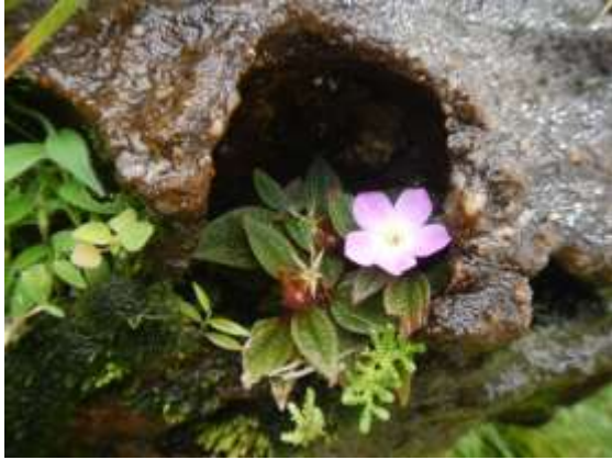
Heterotis pygmaea (A.Chev. & Jacq.-Fél.) Jacq.-Fél.