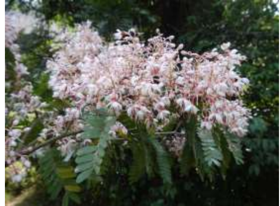
Talbotiella cheekii Burgt © Xander van der Burgt