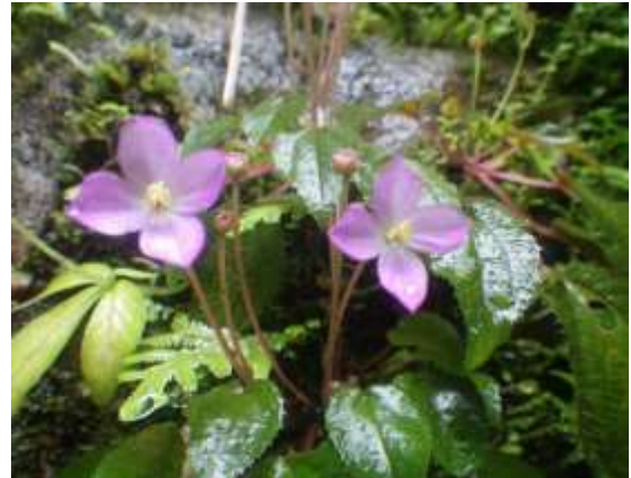
Cincinnobotrys felicis (A.Chev.) Jacq.-Fél